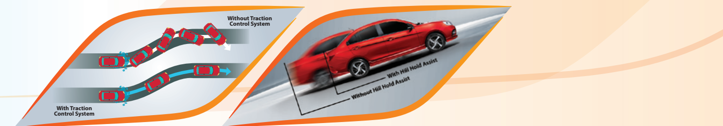
Electronic Stability Control and Traction Control System