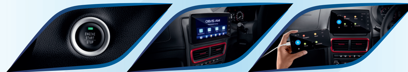
Push Start Button