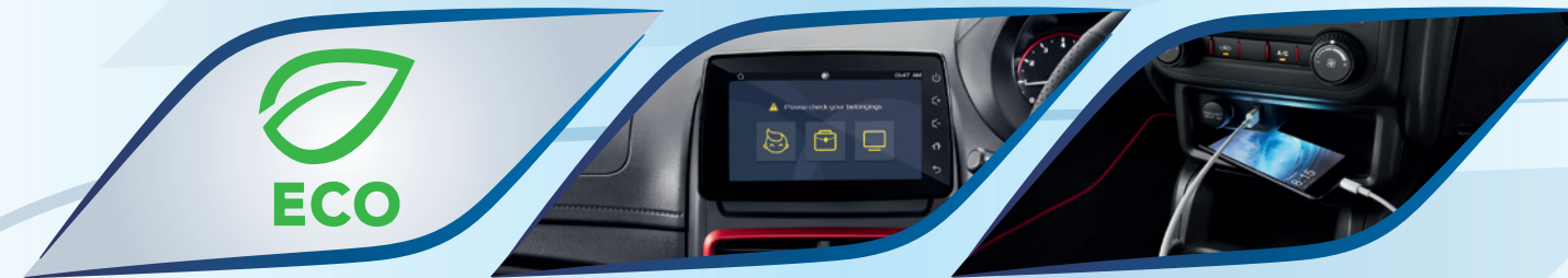
ECO Drive Assist