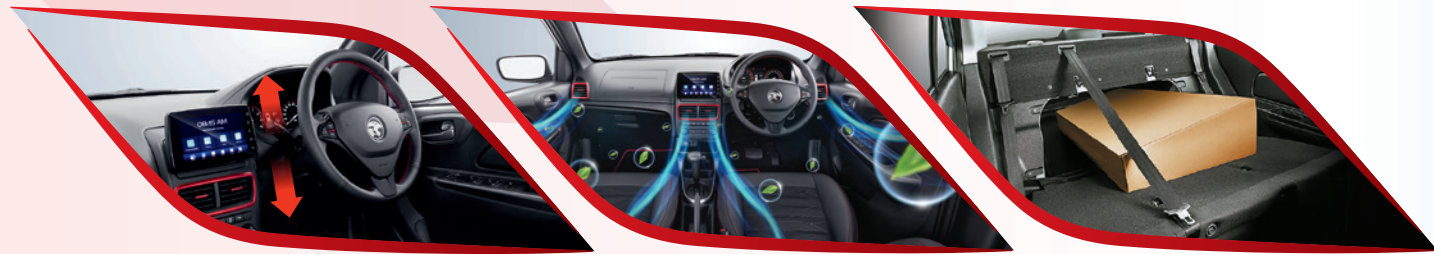
Steering Tilt Adjustment