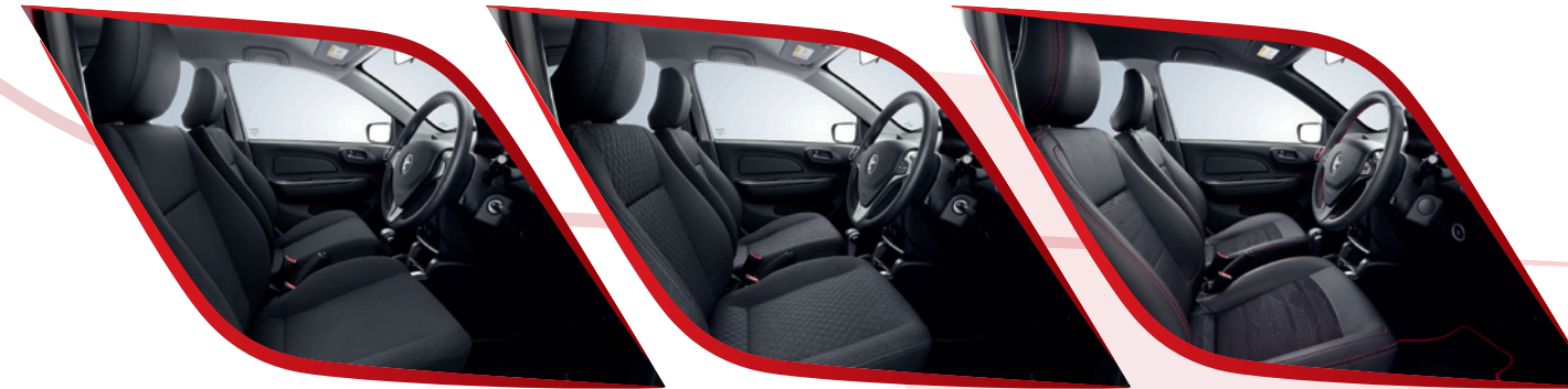
1.3L Standard AT Fabric