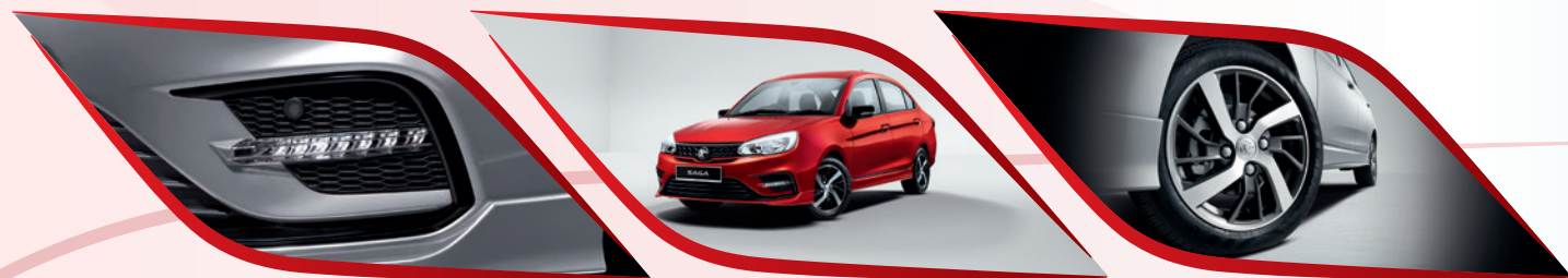
LED Daytime Running Lamps

The new SAGA is an elevation of a proven best seller, with the inclusion of subtle yet significant enhancements, that complete the finishing touches to its familiar and distinctive form.