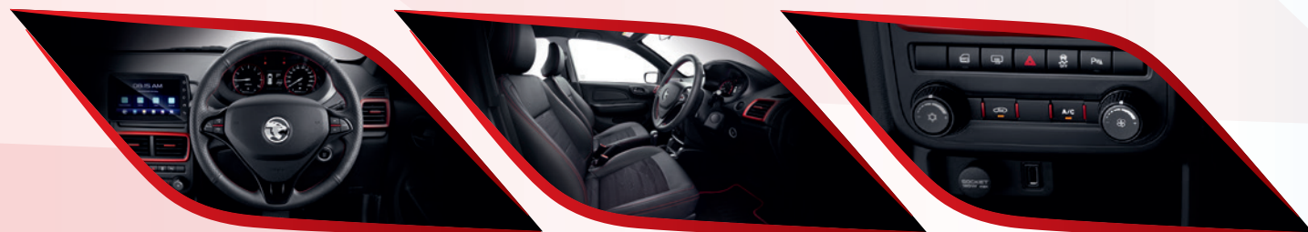
Leatherette Steering Wheel with Switches