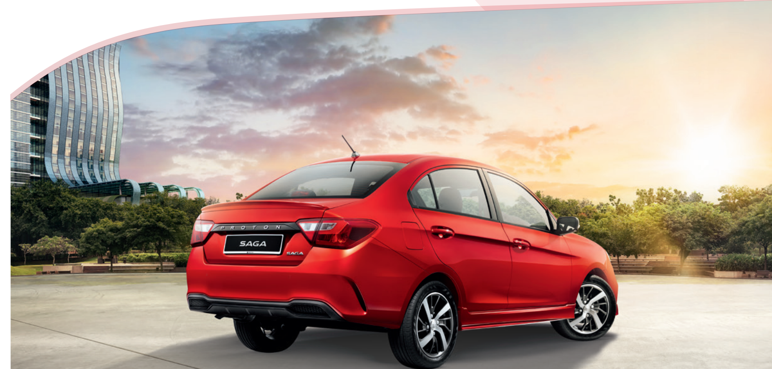
1.3L Premium S AT Semi Leatherette with Fabric